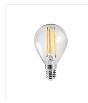
XLED G45 E14 4,5W